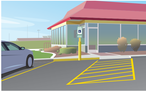
Illustration of a legal angled accessible parking space.

Any facility offering parking for employees or visitors must provide accessible parking for people with disabilities. An accessible parking space consists of a vehicle space and a diagonally striped access aisle. The entire space must be kept clear of obstructions—including ice, snow, shopping cart corrals, trash cans, seasonal garden displays and bicycle racks—at all times.